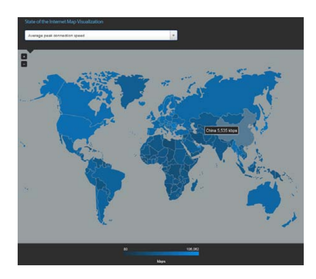
Map-based Data Visualization